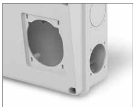
Side cut-outs on right and left sides for DOMO Series (50x60mm flange)